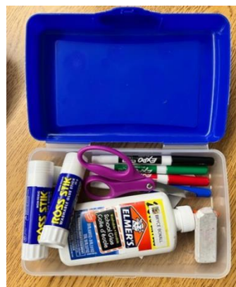
2 glue sticks, scissors, 2 dry erase markers, 1 sharpie, 1 eraser & 2 pencils