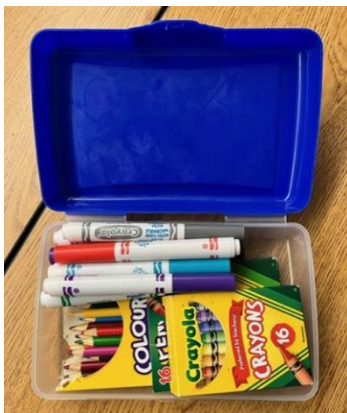
Markers, Pencil Crayons, & Crayons

Examples of how school supplies should be sent. Everything else can be in a large ziploc bag with their name on it.