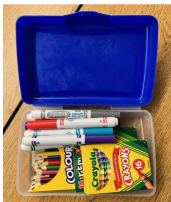
Markers, Pencil Crayons, & Crayons

Examples of how school supplies should be sent. Everything else can be in a large ziploc bag with their name on it.