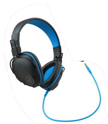
Headphones with auxiliary jack