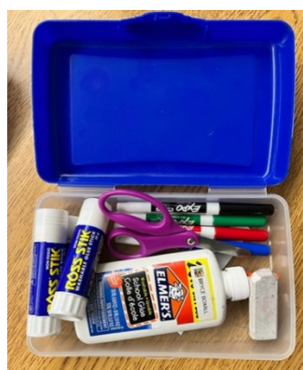
2 glue sticks, white glue, scissors, dry erase markers, 1 eraser & 2 pencils